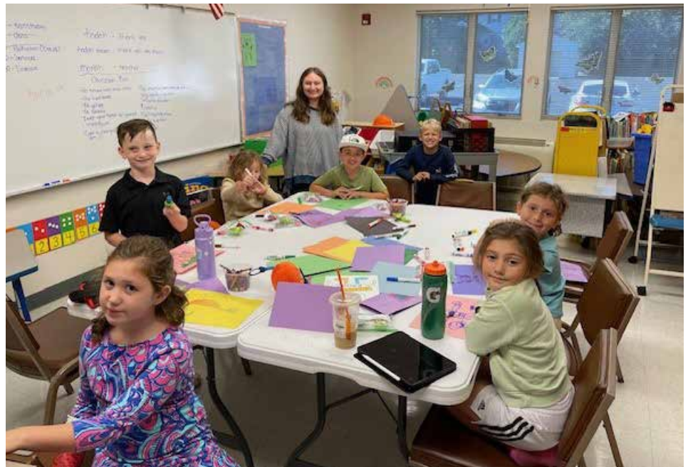
The first day of Religious School